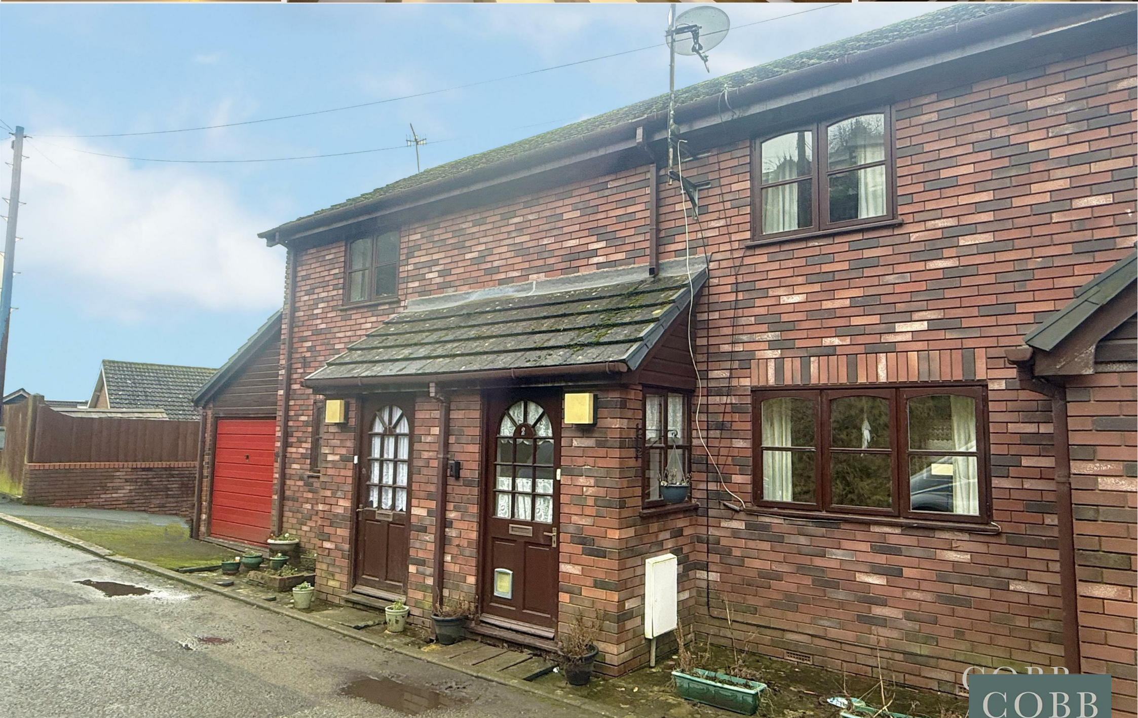
2, Cwm View Cottages, Knighton, LD7 1HF Offers In The Region Of £150,000